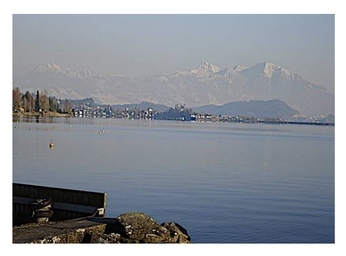
View from the boat landings at Uerikon, Lake Zürich