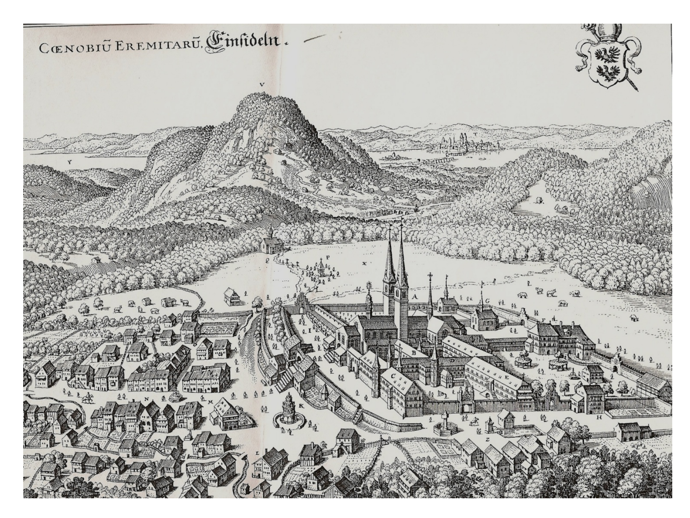
Cloister of Einsiedeln

The legend known as "the journey of the Züricher porridge kettle" illustrates the high degree of communication that was characteristic of towns along the Rhine and its headwaters during these early years. <sup>19</sup> The city council of Zürich once sent an offer to form an alliance with Strasburg, but they were politely turned down on the grounds that their cities were too far apart, and neither could send reinforcements to the other in the event of emergency. The youngest member of the city council in Zürich had a bright idea, and he announced that he could elicit a warmer reply from Strasburg. He ran home, told his wife to set the water boiling in their largest kettle, and to make a large batch of porridge. When the porridge was ready, he hired ten men to accompany him on a boat, moving as fast as possible down the Limmat, through the Aar, onto the Rhine, and thence to Strasburg. They carried the kettle into the Rathaus , where the council was in session. He placed the still-steaming kettle on the table, and said, "Meine Herren, you haven't accepted the alliance with Zürich because you believe that our cities are too far apart, and that we couldn't assist each other quickly enough; that will best be clarified for you by this porridge kettle." When they saw that the porridge was till warm enough to eat, and that it was still steaming, they became ashamed of their rather cold reply.