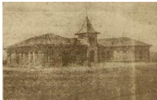
Front View of Spa Establishment

The basic layout of the bathhouse is a wide central building with two lateral wings and a centered addition to serve as the main entrance, measuring about 32 meters [1m=3.28 feet) long and containing 3 complexes ( Komplekte ) for mud baths (with subsequent sea tubs), 11 separate rooms for sea or estuaries baths, 1 room for restricted mud treatment (arm & foot baths), 1 private room for the doctor, 1 room for the medical assistant - masseur and the necessary waiting and service rooms. The building is a single story, with only a small tower rising just above the main entrance, which is a nice room for consultation meetings and spa administration. The living quarters for the visitors has a length of about 43 meters, consisting of 24 single rooms, each with a small, covered veranda completely isolated from the neighbor. To accommodate the diversity of the financial circumstances of patients, larger and smaller rooms were made; double the number envisioned to satisfy the anticipated increasing demand. While the whole bath house is constructed of fired bricks on a foundation made of hard stone, the living quarters’ outer walls only are made of bricks, but the inner walls—to be thrifty—are made of dried clay blocks ( Lehmbatzen ). Both houses are covered with galvanized roofing and provided with cisterns to collect rain water—which, according to the instructions of engineer Beutelsbacher, were also