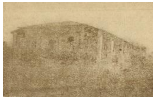
Residence for Spa Visitors

and, therefore, definitely not tiring to climb or descend, even for weak people. The beautiful wide dune with ample sea sand stretching many kilometers to the left and right of the spa site, is completely protected against sharp north winds and, therefore, creates the most ideal place for air, sand, and sun bathers. The beach is also very suitable for children since, due to the flat shore, they can go far into the sea without risk. The sea and steppe air is absolutely pure and very ozone rich; thanks to a persistent movement of air (a slight “Breeze”) via Lake Burnas to the large sand dune, in the direction of the sea, the air in Bad Burnas is not fouled up by the estuary air which the spa public in other health resorts often find so extremely annoying. The complete isolation of the resort from any human settlement guarantees the purity of the air, and also the rest so valued by the sick and suffering people.