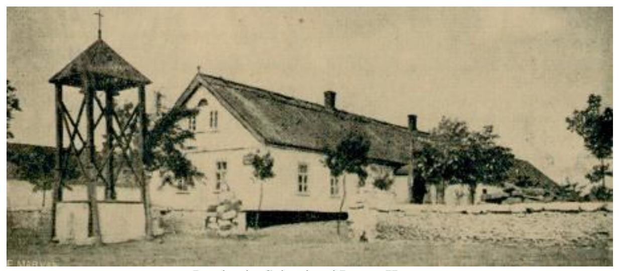
Pawlowka School and Prayer House

On Sunday afternoon, all gathered somewhere and in the winter the room set aside for spinning could never accommodate all who came together for these gatherings, which one called "Mayen" [*]. At these gatherings, there was always such a good mood, happy entertainment, humor and