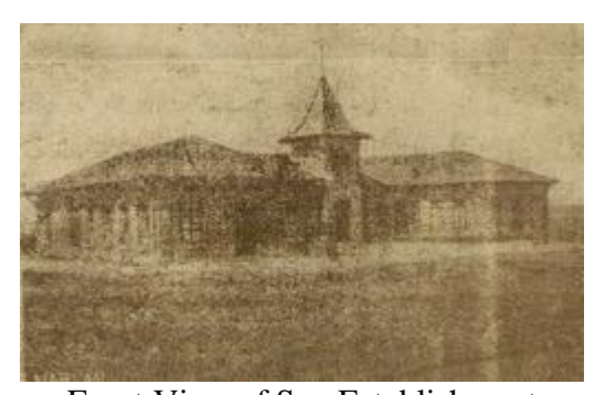
Front View of Spa Establishment

The basic layout of the bathhouse is a wide central building with two lateral wings and a centered addition to serve as the main entrance, measuring about 32 meters [1m=3.28 feet) long and containing 3 complexes ( Komplekte ) for mud baths (with subsequent sea tubs), 11 separate rooms for sea or estuaries baths, 1 room for restricted mud treatment (arm & foot baths), 1 private room for the doctor, 1 room for the medical assistant - masseur and the necessary waiting and service rooms. The building is a single story, with only a small tower rising just above the main entrance, which is a nice room for consultation meetings and spa administration. The living quarters for the visitors has a length of about 43 meters, consisting of 24 single rooms, each with a small, covered veranda completely isolated from the neighbor. To accommodate the diversity of the financial circumstances of patients, larger and smaller rooms were made; double the number envisioned to satisfy the anticipated increasing demand. While the whole bath house is constructed of fired bricks on a foundation made of hard stone, the living quarters' outer walls only are made of bricks, but the inner walls—to be thrifty—are made of dried clay blocks ( Lehmbatzen ). Both houses are covered with galvanized roofing and provided with cisterns to collect rain water—which, according to the instructions of engineer Beutelsbacher, were also